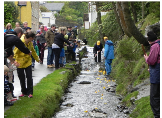
Fun at the Annual Duck Races at Cardingmill Valley