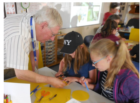
Hydro-electric power being developed at our School Project