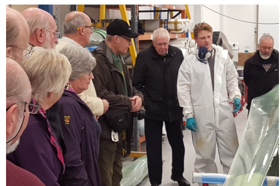
Visiting Ecotricity's windmill factory