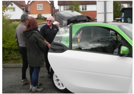
Advice at the Electric Car Show