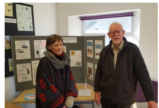
Keeping the Strettons Warm