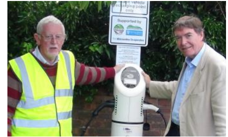
Philip Dunne MP at the Electric Car Show– with our Charge Point