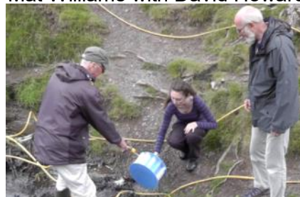
In Carding Mill Valley with School