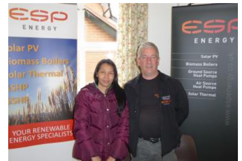
ESP Energy ready to give advice at our Open Homes Day