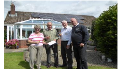
Prize cheque awarded to All Stretton residents by Salop Energy following installation of PV Panels