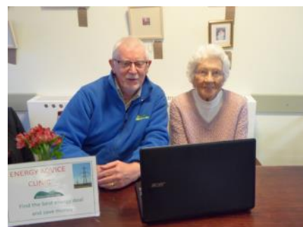
Providing advice at Mayfair