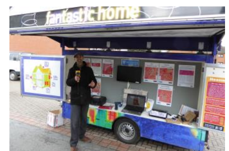
Thermal image display outside Co-op