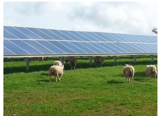
Solar farm in the Wye Valley with sheep