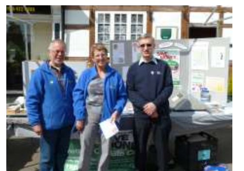
Exhibition in The Square