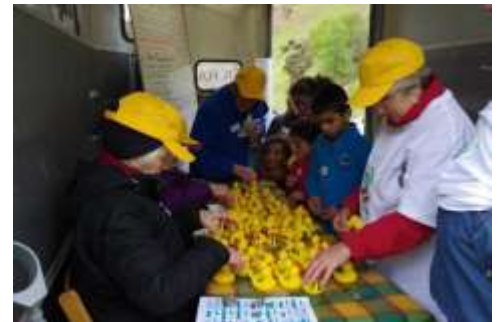
Sorting the ducks