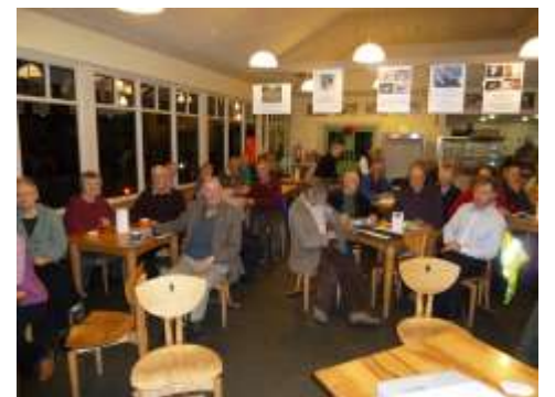
Discussing Hydro energy