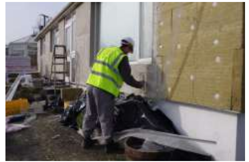
Installing solid wall insulation