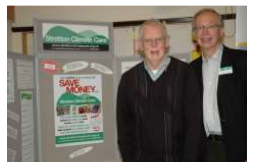
At the UNA Conference