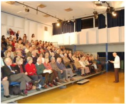
Debate at Church Stretton School