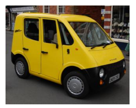
Electric car at Green Fayre