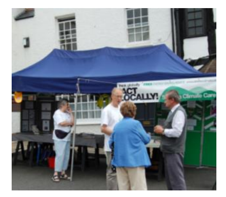
Green Fayre- Church Stretton,